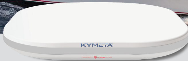
PEREGRINE u8 LEO SATELLITE TERMINAL