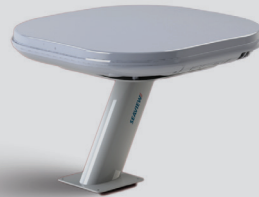
EXAMPLE OF THE PEREGRINE u8 INSTALLED ON AN OFF-THE-SHELF PEDESTAL